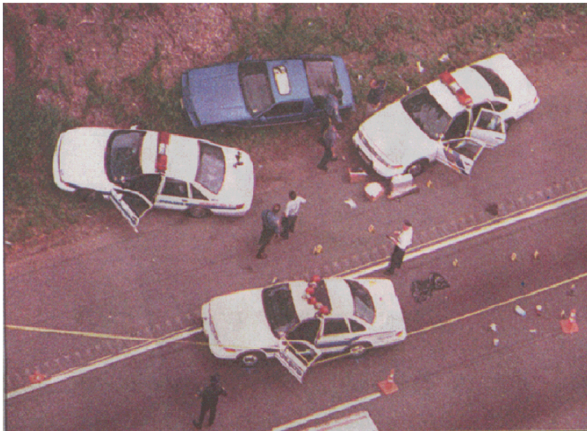
Overhead view of scene of Stanton Crew shooting, illustrating officer crossfire positioning.